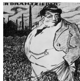
The String-Puller , German antisemitic poster, 1924

THE BREMAN JEWISH HERITAGE & HOLOCAUST MUSEUM