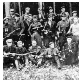
Jewish partisans near Vilna, Lithuania, 1944

Sessions are held at The Breman , 1440 Spring Street at 18th Street, Atlanta, GA 30309