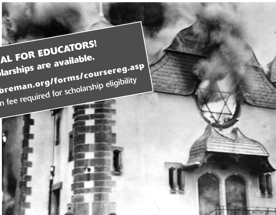
Synagogue in Sieger, Germany, November 10, 1938 ( Kristallnacht )

Presented by The Lillian and A.J. Weinberg Center for Holocaust Education of The Breman Jewish Heritage & Holocaust Museum