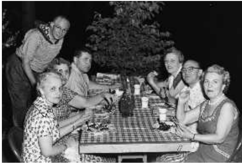
The Don't Worry Club, Atlanta, Georgia, c. 1050. Seasoned With Love, page 155.