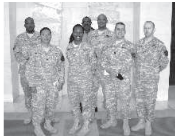
A group of soldiers from Fort Gordon tours The Breman in April.