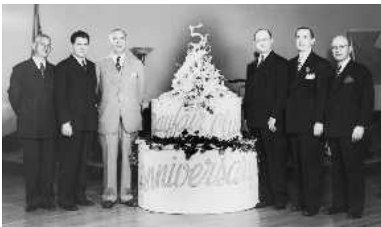
Anniversary celebration at The Mayfair Club, Atlanta, Georgia, 1935. Seasoned With Love, page 251.